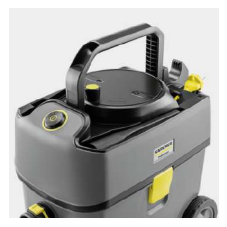
Sustainable and robust: 45% recycled content