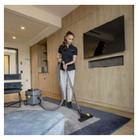
Ultra-quiet: virtually silent operation at just 52 dB(A)